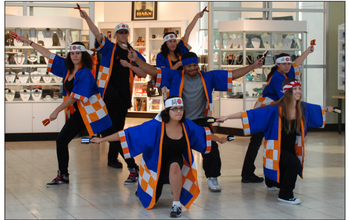
Student dancers from the Japanese Club.

groups to highlight their culture and talents through information tables and performances such as capoeira by The Brazilian Cultural Arts Exchange, Yosakoi-style dancing by the Japanese Club, and choral music by the Agbedidi Pazení Sauti Africa choir.