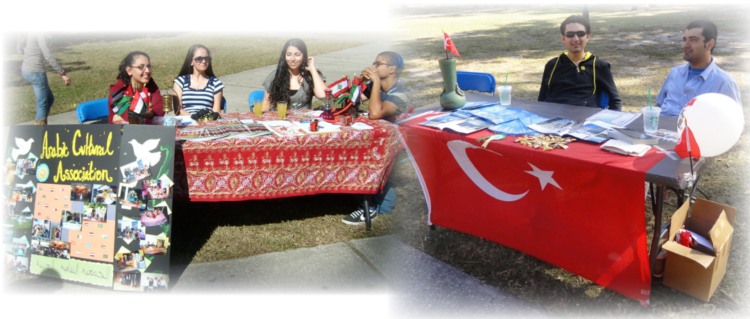
Volunteer for International Student Affairs Tabling at Plaza of the Americas

Enjoy the gallery of photos documenting the events that took place during International Education Week 2011