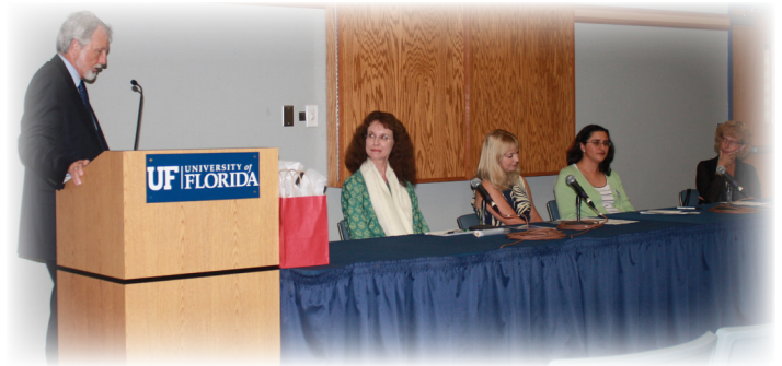
Faculty Panel: "International Engagement and Career Growth" sponsored by the UF International Center and the College of Education