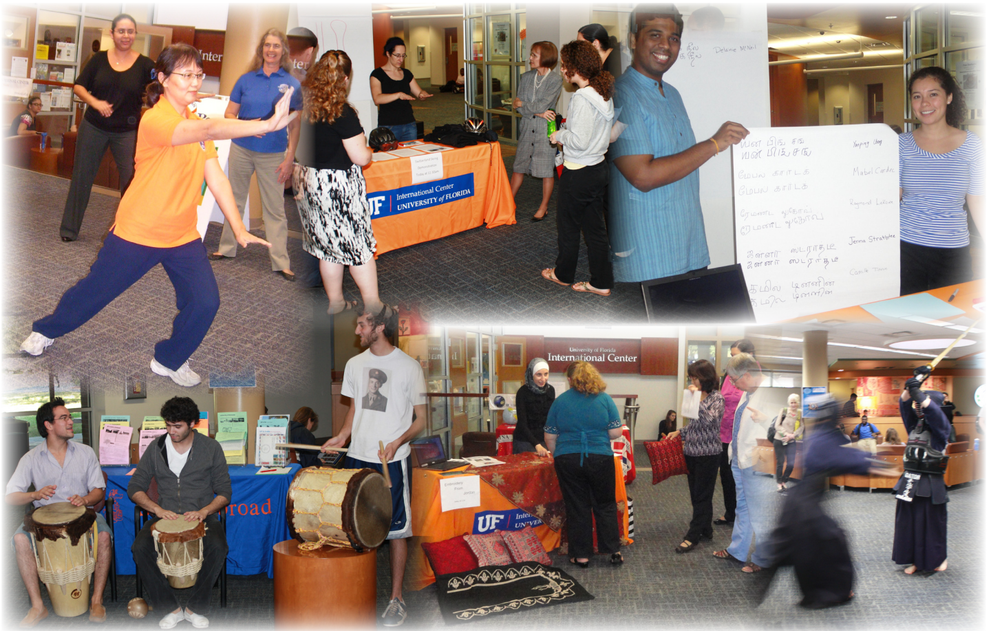
FLASH International Demonstrations by UF international students