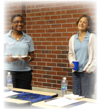
Networking Beyond Borders hosted by the UF College of Education