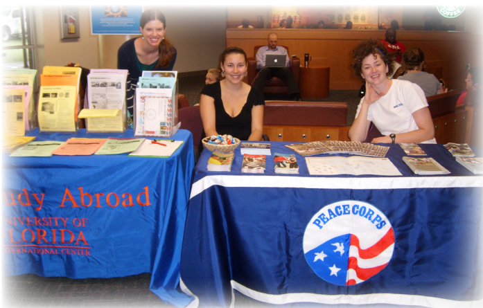
Study Abroad and Peace Corps Mini Fair