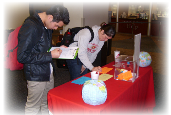
UF International Center's Global Connections Raffle