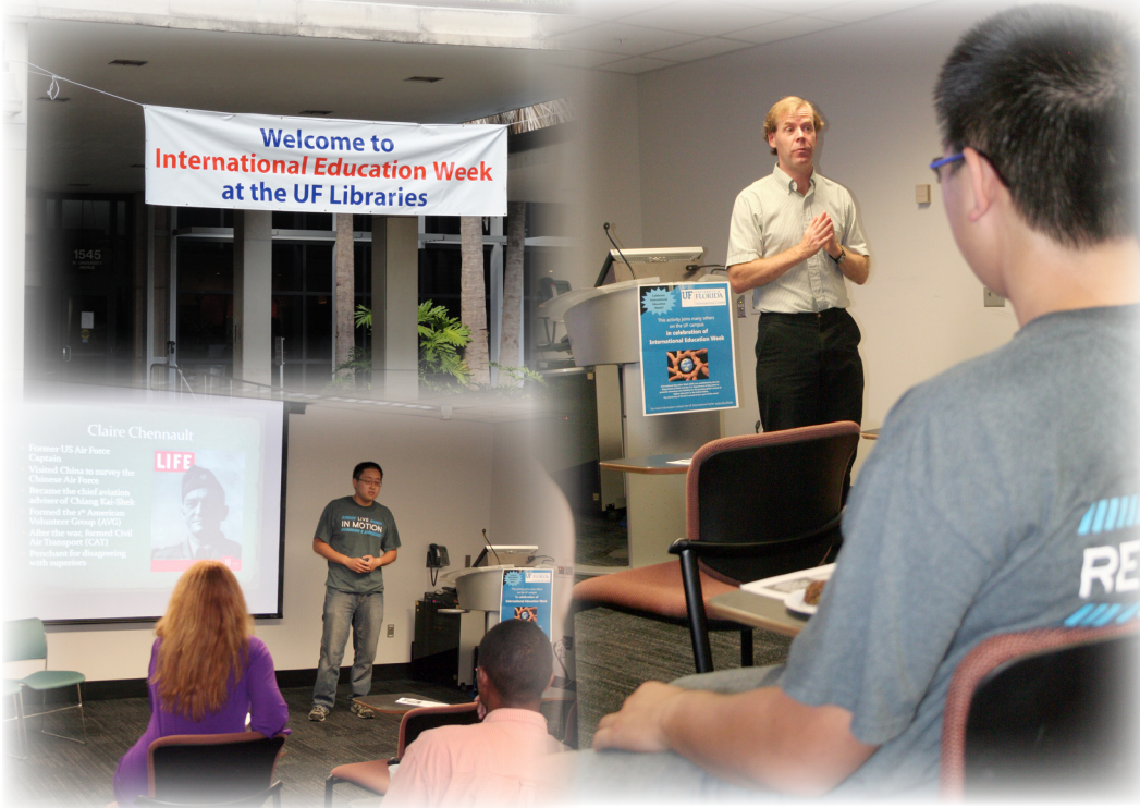
The UF libraries hosted several IEW very successful activities, including the "Arabic Culture: Enrichment through International Education" session.