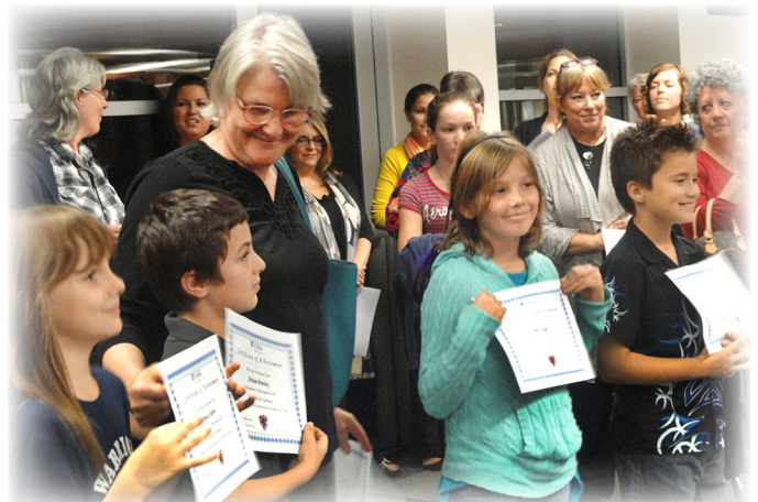
K-12 Global Art Exhibit Reception featuring art created by students from the School Board of Alachua County