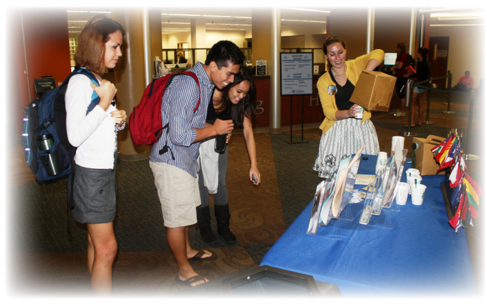
Coffee & UF Around the World: Celebrating International Education week by sampling international flavors of Starbucks coffee