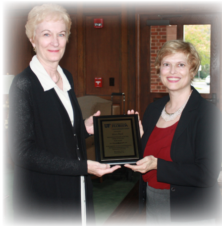
International Educator of the Year Award Ceremony