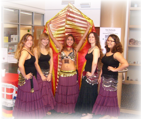
International Education Week kick-off performance by Belly Gators