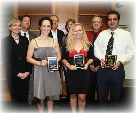
International Student Services Awards Ceremony