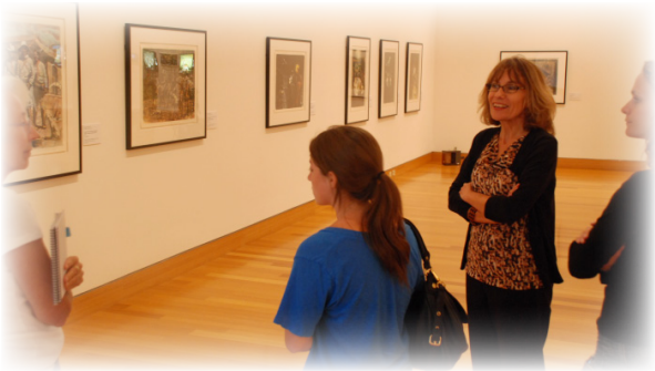
Art Across the Globe: 5 Objects, 5 Continents; Tour by Kerry Oliver-Smith, Curator of Contemporary Art