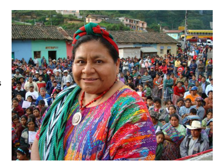
Rigoberta Menchú Tum; Guatemalan Indigenous Rights Activist