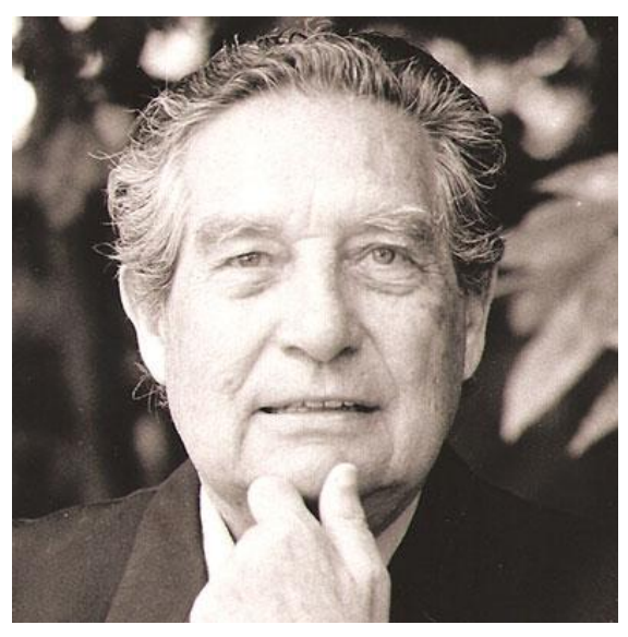
Octavio Paz; Mexican port, writer and diplomat

12. "What sets worlds in motion is the interplay of differences, their attractions and repulsions. Life is plurality, death is uniformity. By suppressing differences and peculiarities, by eliminating different civilizations and cultures, progress weakens life and favors death.